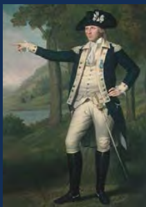
Ralph Earl— Metropolitan Museum of Art